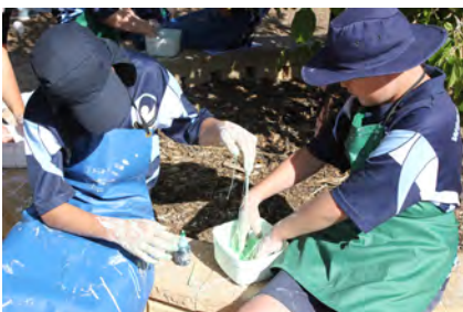
Getting down & dirty with Ooblek!

The experience requires the students to apply some real problem solving skills to crack codes to complete a challenge, as well as getting their hands dirty with Ooblek , a non-Newtonian fluid. STEM skills are needed in today's workplace: problem solving, analytical thinking, and the ability to work both collaboratively, as well as independently.