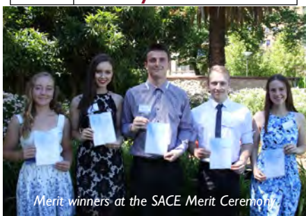
Merit winners at the SACE Merit Ceremony.